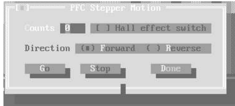
Figure II.3 : PFC Control User Dialogue

If a UPG_PFC interface is detected, the user will have control of the PFC through the system software and a user dialogue as shown in Figure II.3. This user dialogue is usually found as a selection in the main Hardware or Peripheral_bus menu selections of the UPG3696/UPG4800/UPG6000 system software.